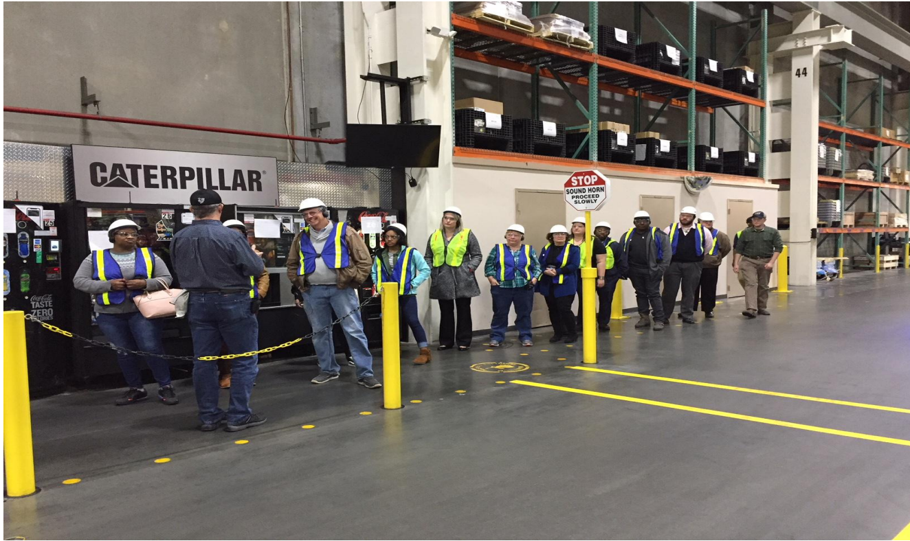
Made in the Region Parent Only Tour, sponsored by Georgia Association of Manufacturers, February 2019